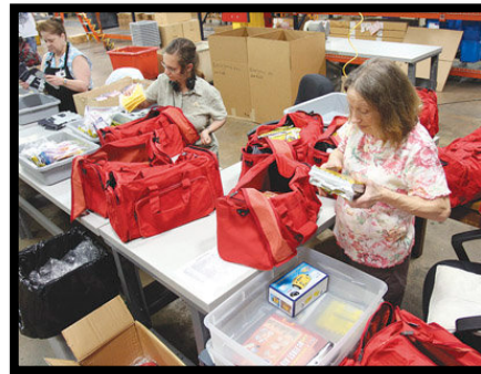
Distribution of Emergency Supplies